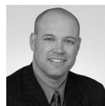
Sen. Sandack Score: 79