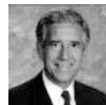
Sen. Lauzen Score: 75

Illinois State Senators with a lifetime rating of 75% or higher are LIFT Leaders.