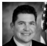
Sen. McCarter Score: 75