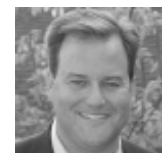
Sen. Murphy Score: 76