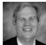
Sen. Johnson Score: 75