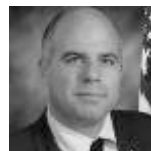
Sen. McCann Score: 85