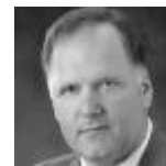
Sen. Cultra Score: 85