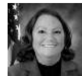
Sen. Schmidt Score: 80