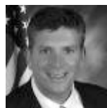
Sen. LaHood Score: 80